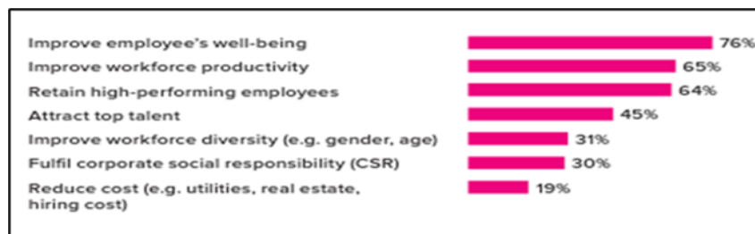
Figure 3. Top reasons Malaysian employers adopt WLPs (Pre-Covid 19) (TalentCorp-UNDP, 2021)

The Life at Work Survey shows that employers cited improving employee's well-being as the top reason for offering WLB practices including FWAs (76%), followed by improving workforce productivity (65%) (Figure 3). The WFH experience during the MCO confirms the benefits of FWAs/WFH to employee well-being and productivity. In the Life At Work Survey, employers perceived that the employees who would benefit most from WLPs were women with children, millennials, and people with caregiving responsibilities. However, the WFH Survey showed substantial Quality of Life (QOL) and productivity benefits were experienced across gender, age, and childcare-giving categories. In terms of QOL, men and women childcare givers were both more likely to report improvements compared to their non-child giver counterparts; interestingly, men caregivers were reported to experience the highest benefits.